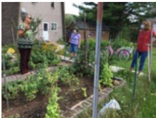
garden tour at Arkin's

2020 was the first year of the Grow an Extra Row Project, and it was a huge success. 30 % of KUUF congregants participated by donating veggies/flowers/herbs from their gardens, while others contributed garden related jokes/poems. Four deliveries (one of flowers) were made to 5 families. On 8/23, we had sunny Garden Tour of participating gardens, ending at our communal garden with lemonade and delicious treats.